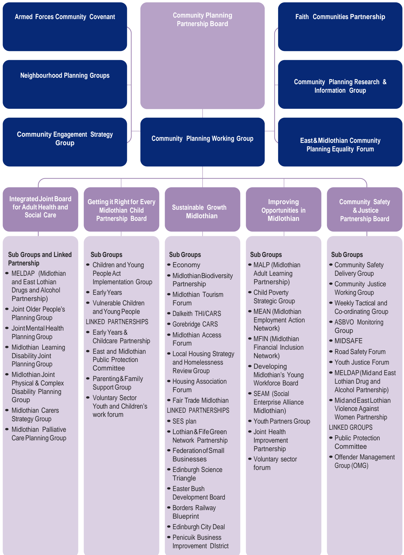
Diagram 3: Midlothian community planning structure